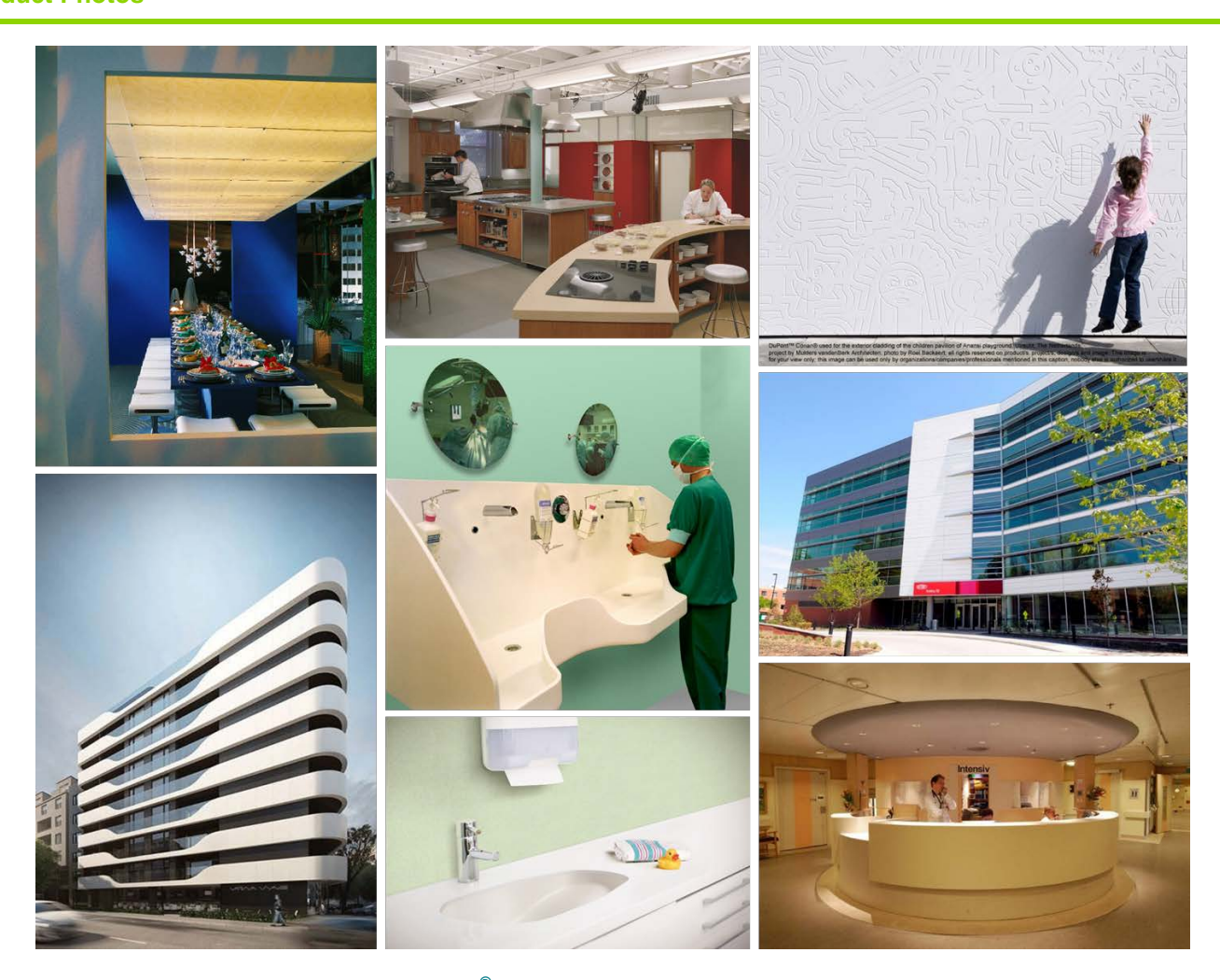
Figure 1: Corian<sup>®</sup> solid surface in its various applications