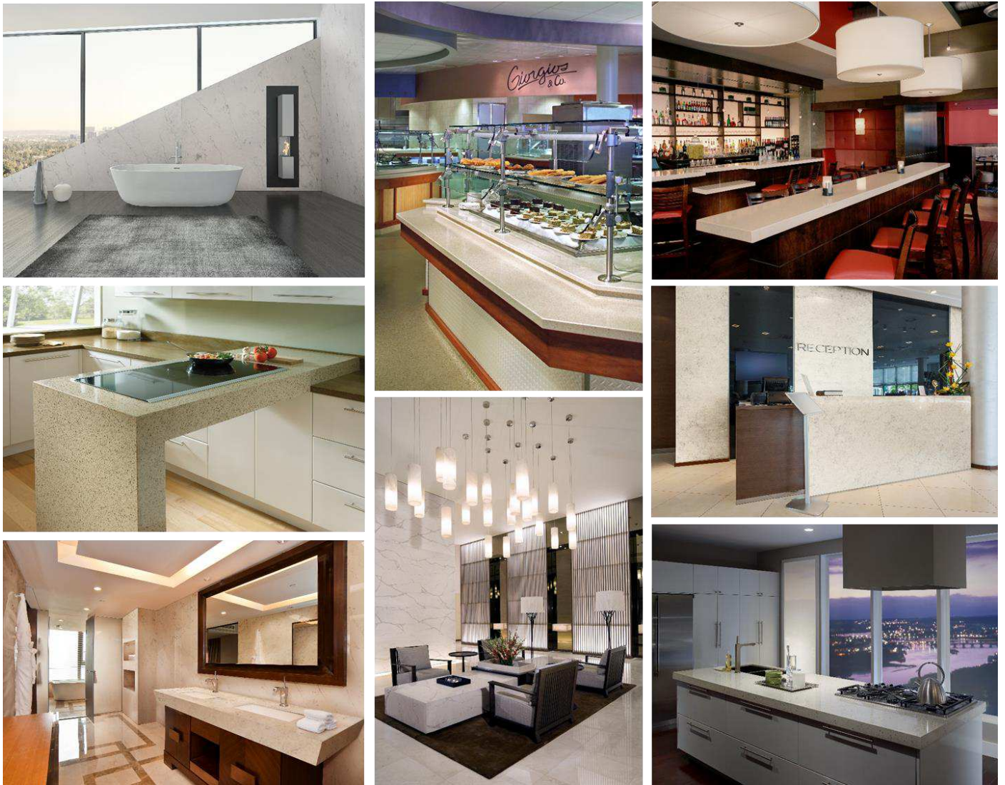
Figure 1: Photographs of Zodiaq® quartz in its various applications