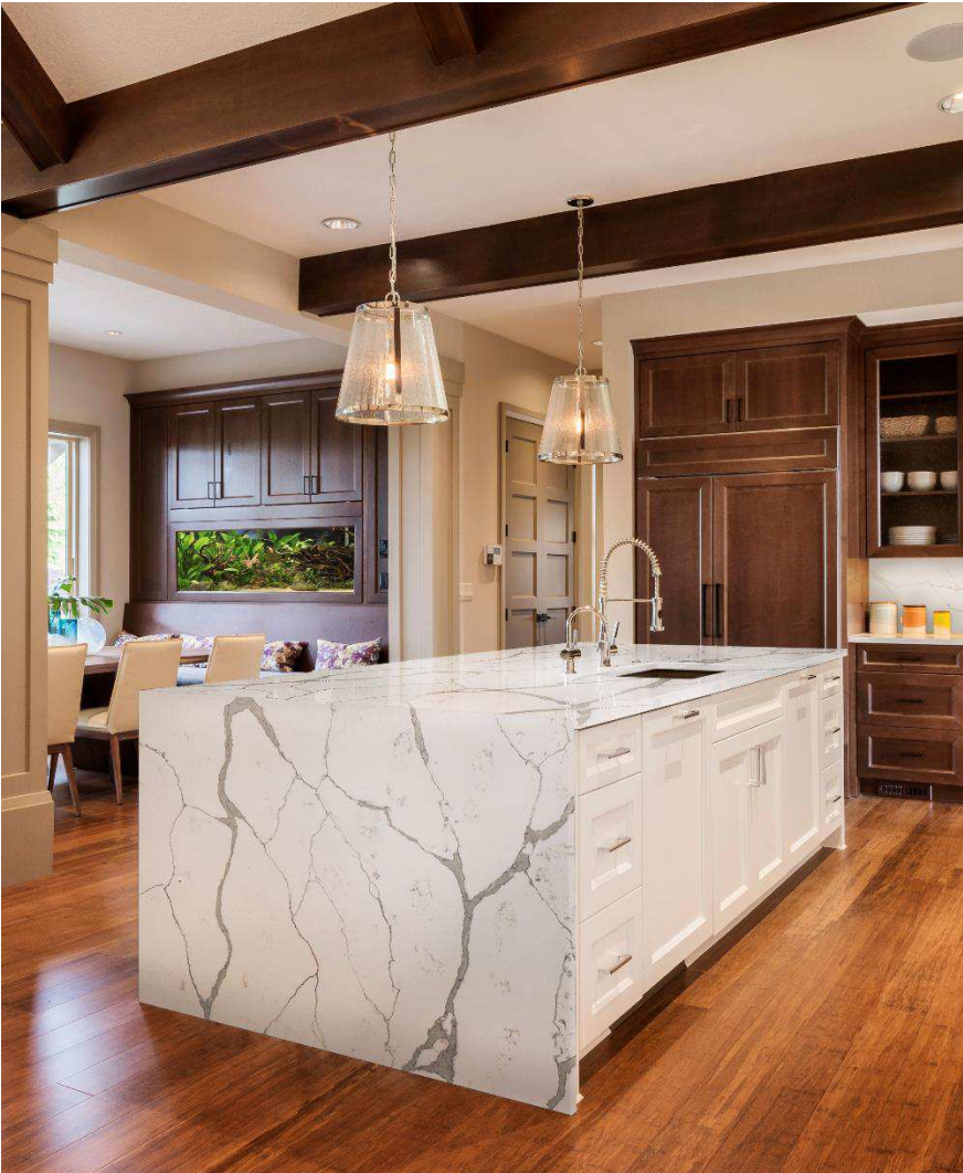
Zodiaq® Calacatta Natura residential kitchen installation

Functional unit is 1 m 2 (10.8 ft 2 ) of product for a period of 10 years in use.